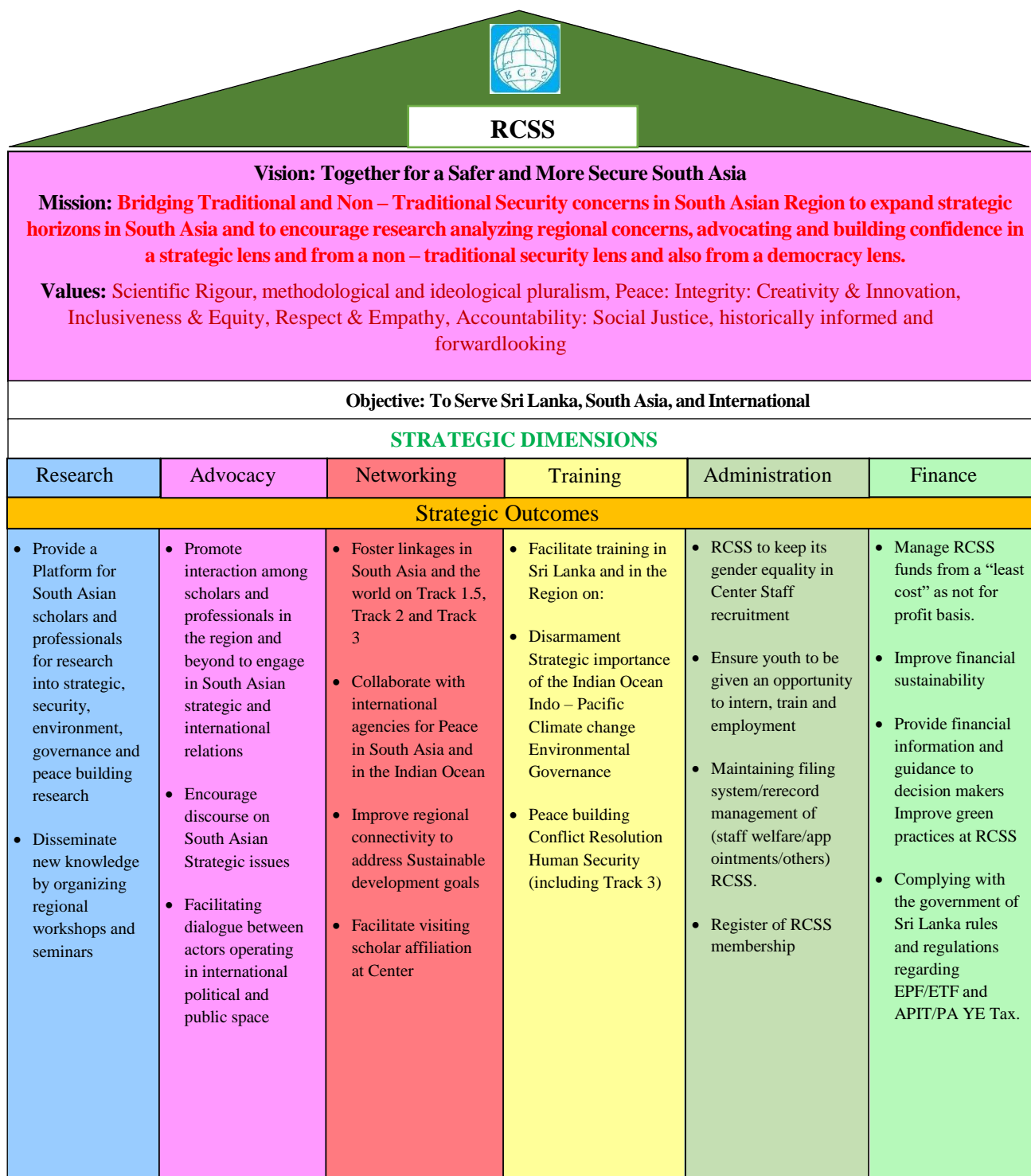
Figure 1.1: Strategic Plan – Regional Center for Strategic Studies