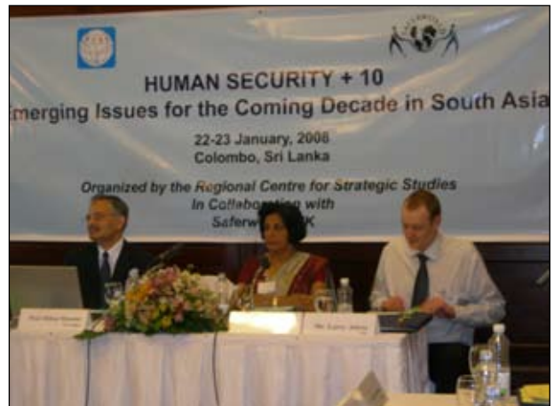
Conference in progress