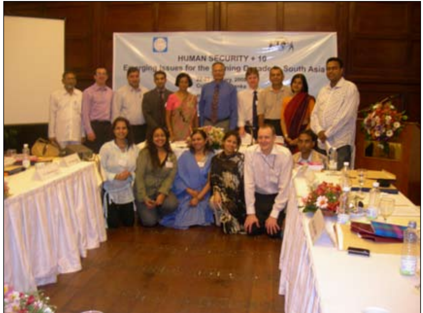
Participants of Human Security of South Asia conference

The conference expects to: develop a shared understanding among participants on the outlook for human security in the South Asia region in the coming ten years; build on existing links between organizations with